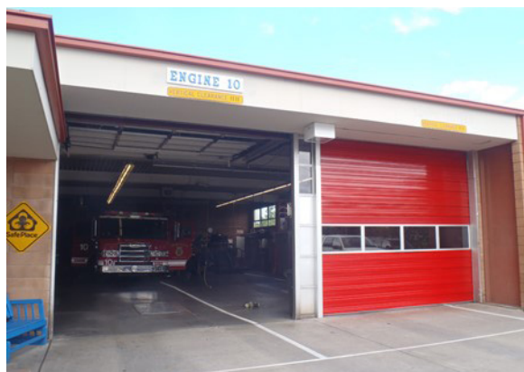
Figure 1. Station 10 apparatus bay doors with permanent back wall.

At the time of our evaluation, Station 10 had a permanent back wall in the apparatus bay. Stations 16 and 17 were pull-through fire stations that had apparatus bay doors on the front and back of the fire station. This pull-through design allowed more airflow and natural dilution through the apparatus bay when front and back doors were open compared to Station 10.