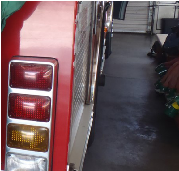
Figure 3. Turnout gear stored near fire engine exhaust in Station 16.

Fire fighter turnout gear was stored directly across from apparatus exhaust pipes at all three stations (Figure 3). Fire fighters reported that these areas in the apparatus bays were more susceptible to blackening from apparatus exhaust between cleanings.