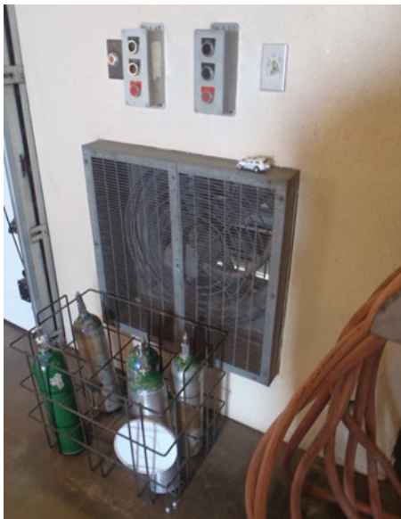
Figure 2. Five small compressed gas cylinders partially blocking the intake of a floor level wall exhaust fan at Station 17.

In addition to the ceiling fan, Station 17 had a wall-mounted, floor level exhaust fan (Figure 2) that was connected to a timer controlling the wall and ceiling fans. The timer engaged both fans before an apparatus left the station. We released smoke near the exhaust fan and observed that air further than 5–10 feet away did not move with the floor exhaust fan running. We also observed that compressed gas containers were stored in front of the floor exhaust fan, which would diminish the fan's performance.